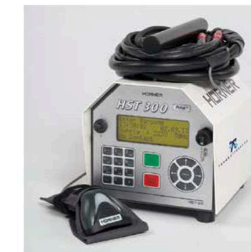
Flat Face Flanged Cap