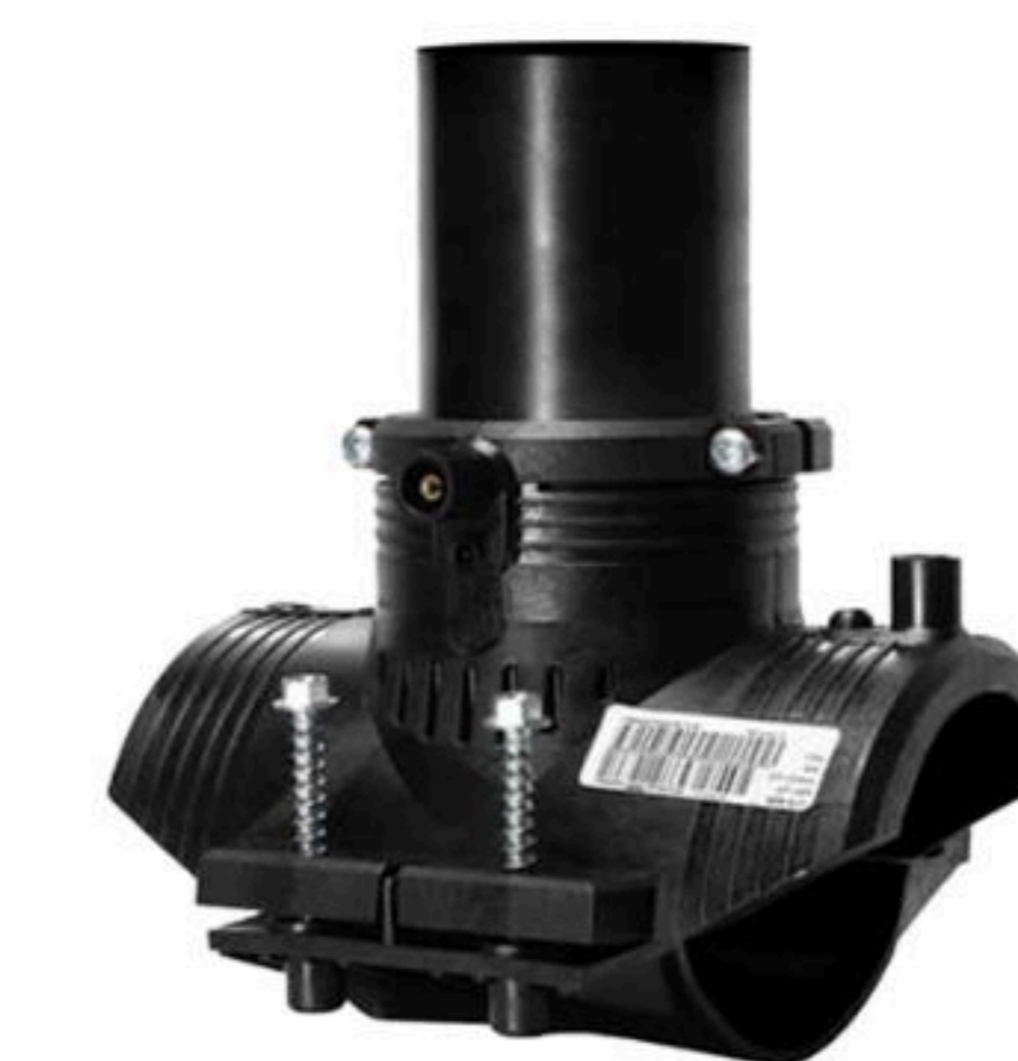
Flat Face Flanged Cap