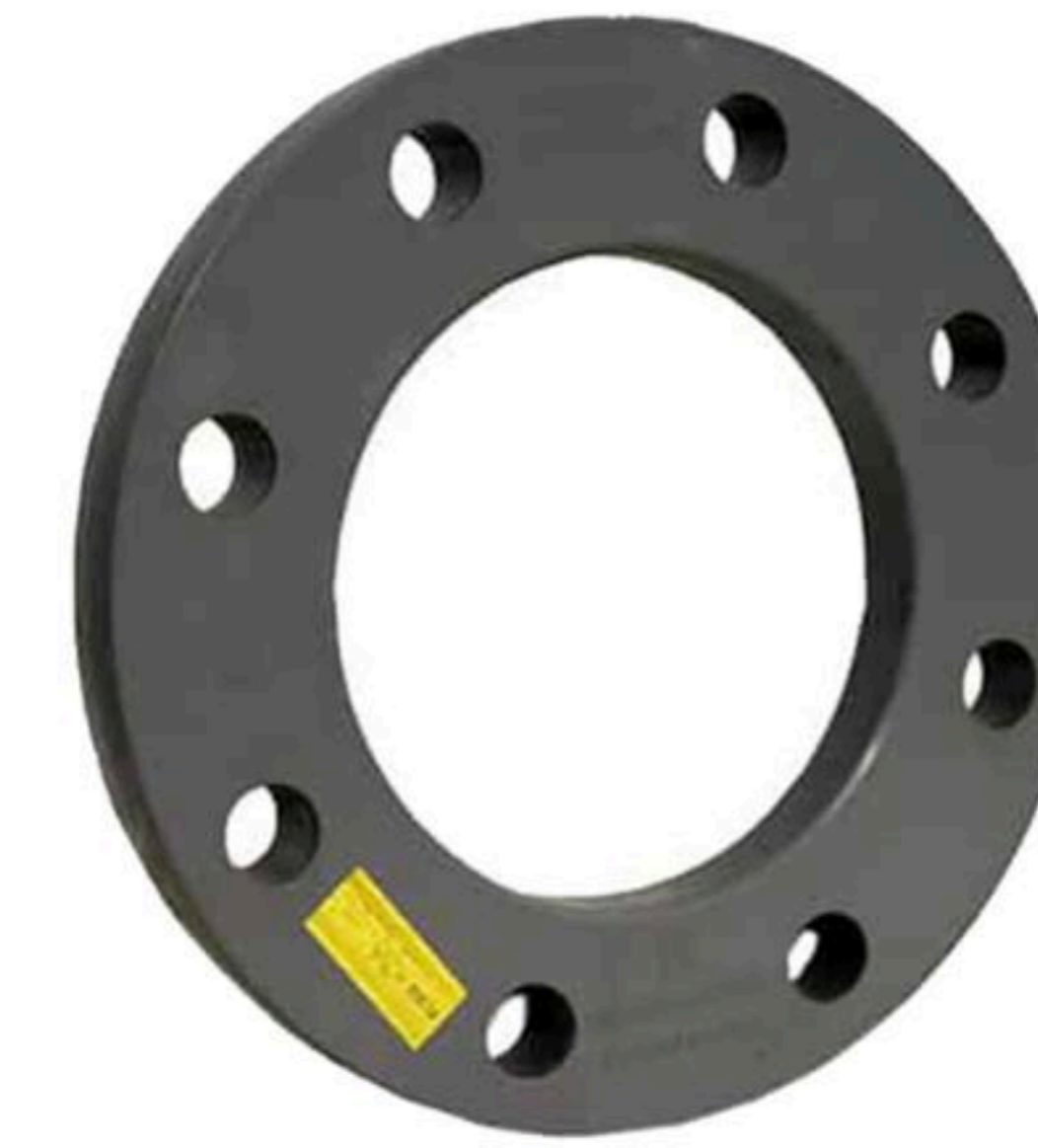
PP/Steel Backing Ring