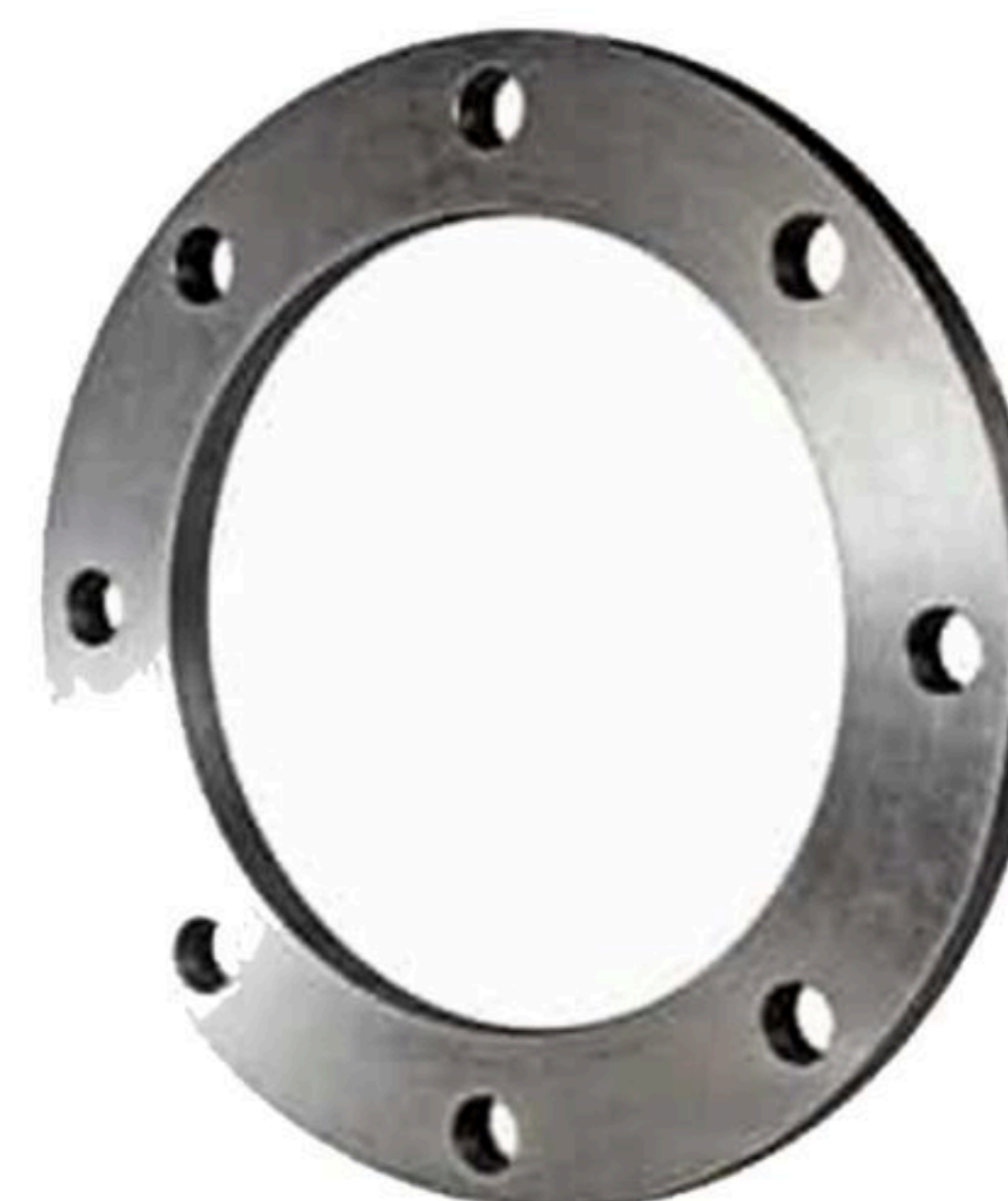
Backing Ring - PN16