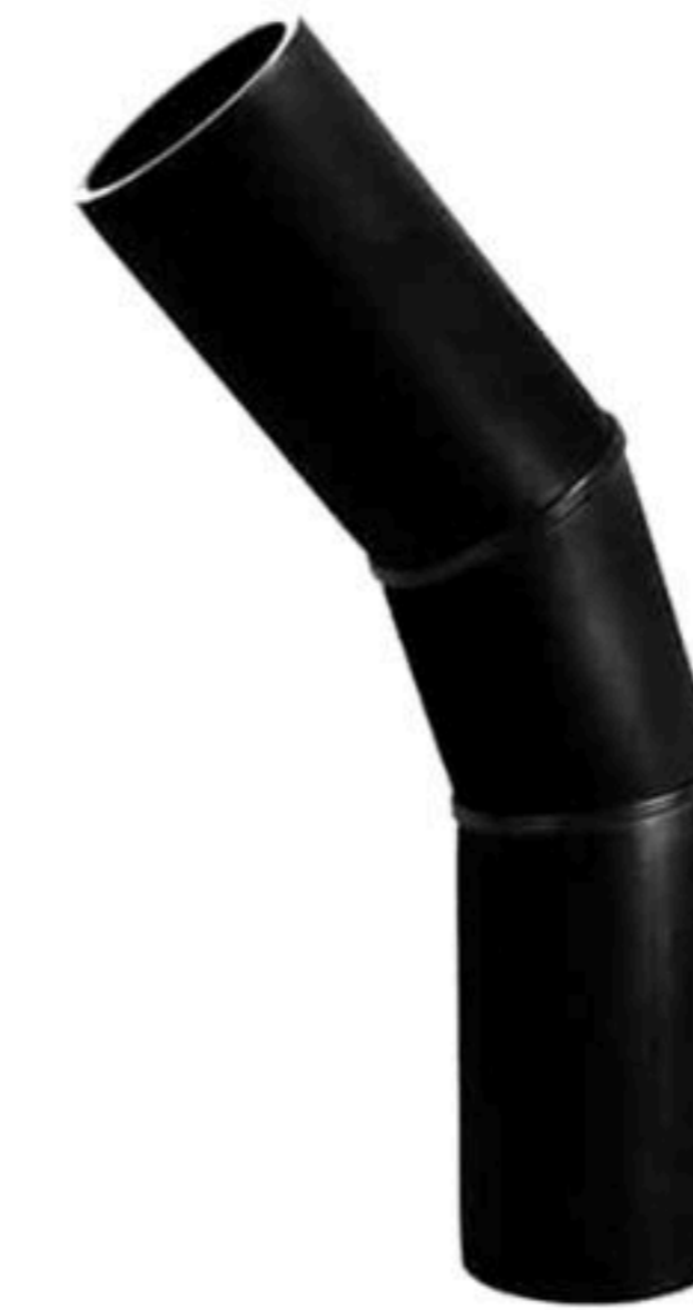
Fabricated Elbow 45°