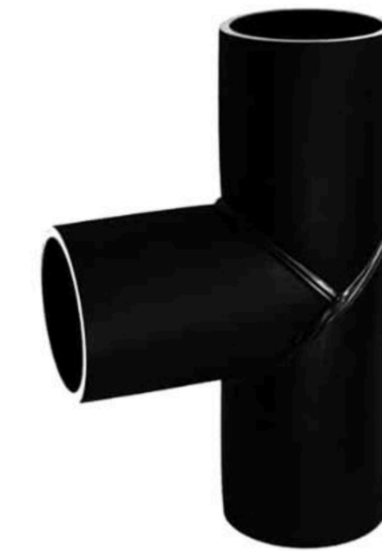
Fabricated Equal Tee 90°