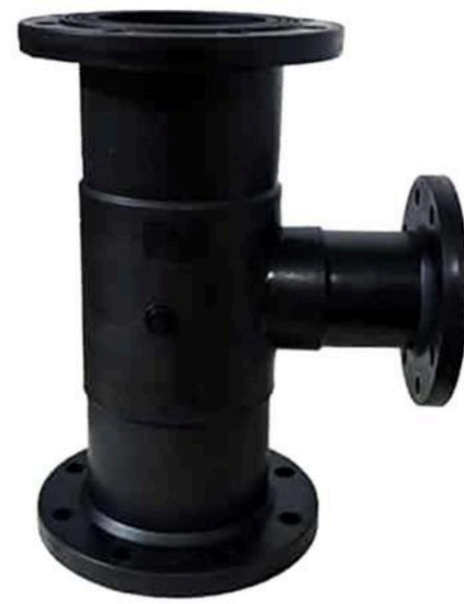
Flat Face Flanged Reduced Tee 90°