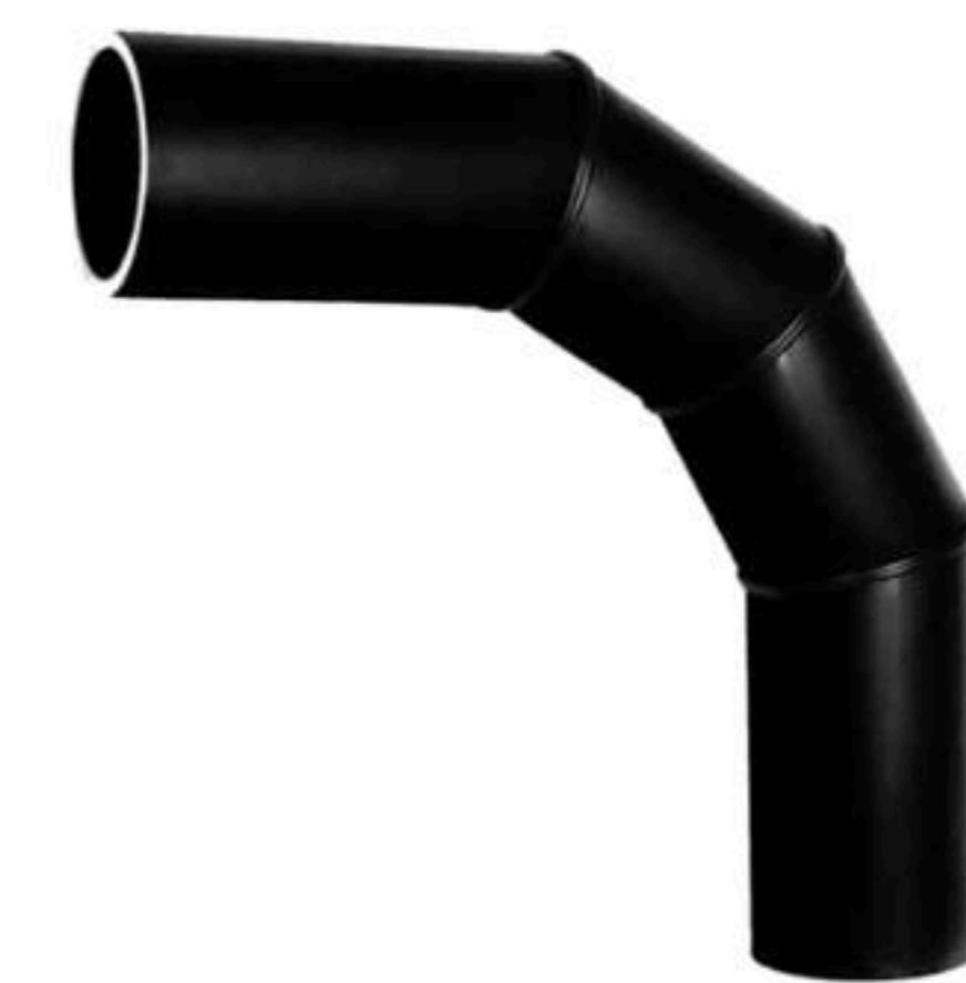
Fabricated Elbow 90°