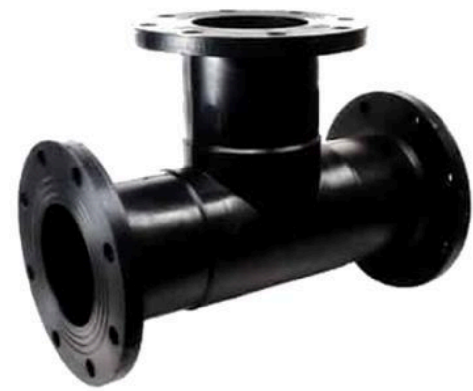
Flat Face Flanged Equal Tee 90°