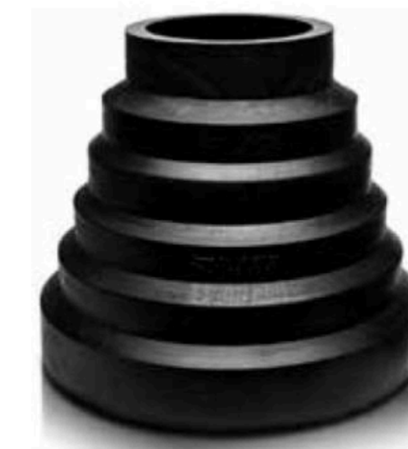
Concentric Reducer short spigot