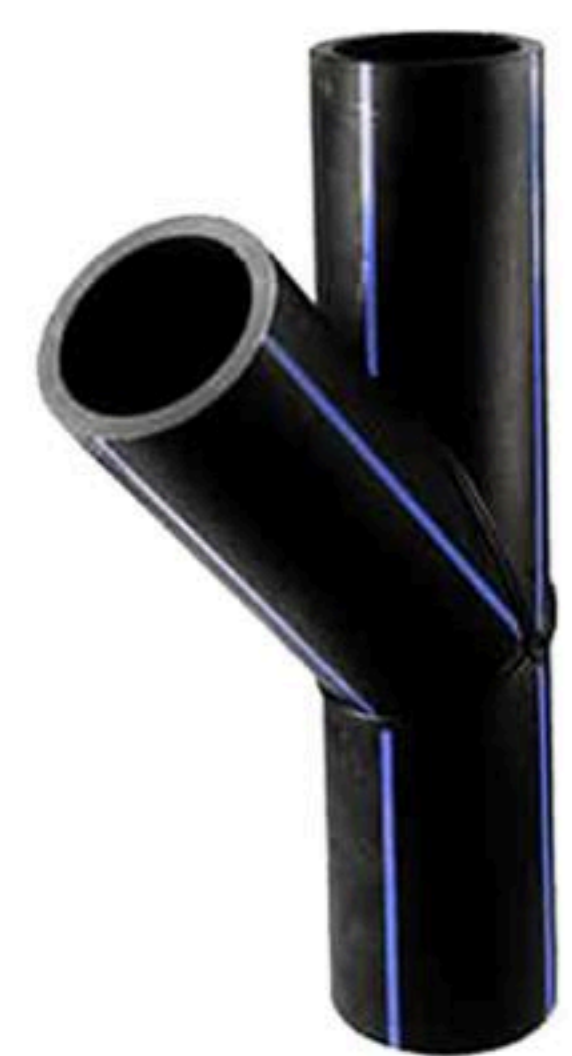
Fabricated Equal Tee 45°