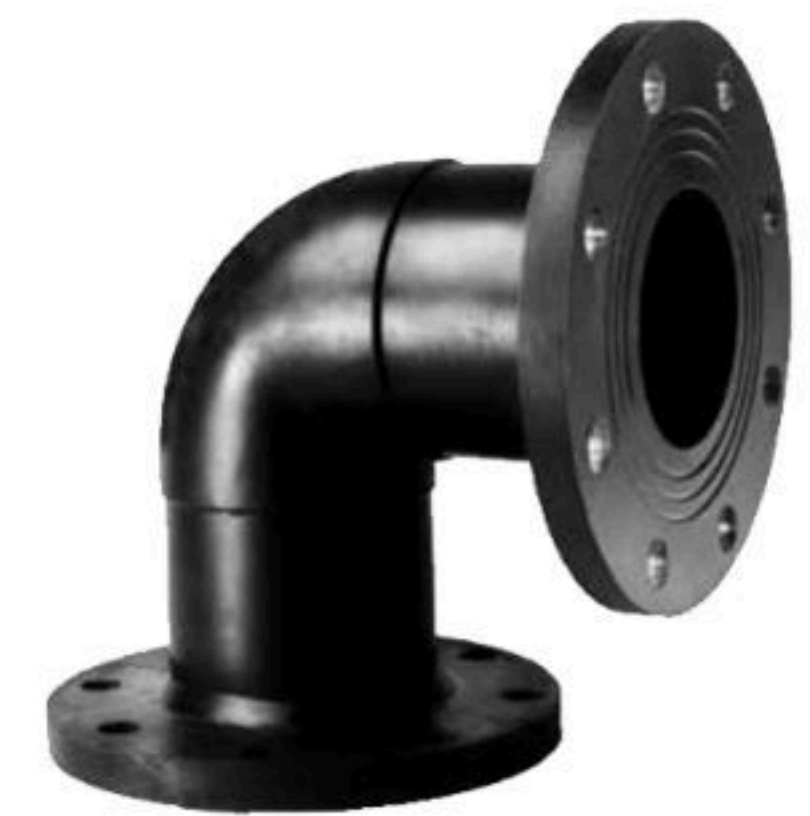
Flat Face Flanged Elbow 90°